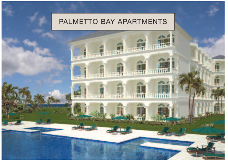
PALMETTO BAY APARTMENTS