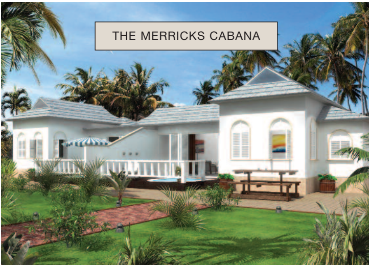
THE MERRICKS CABANA