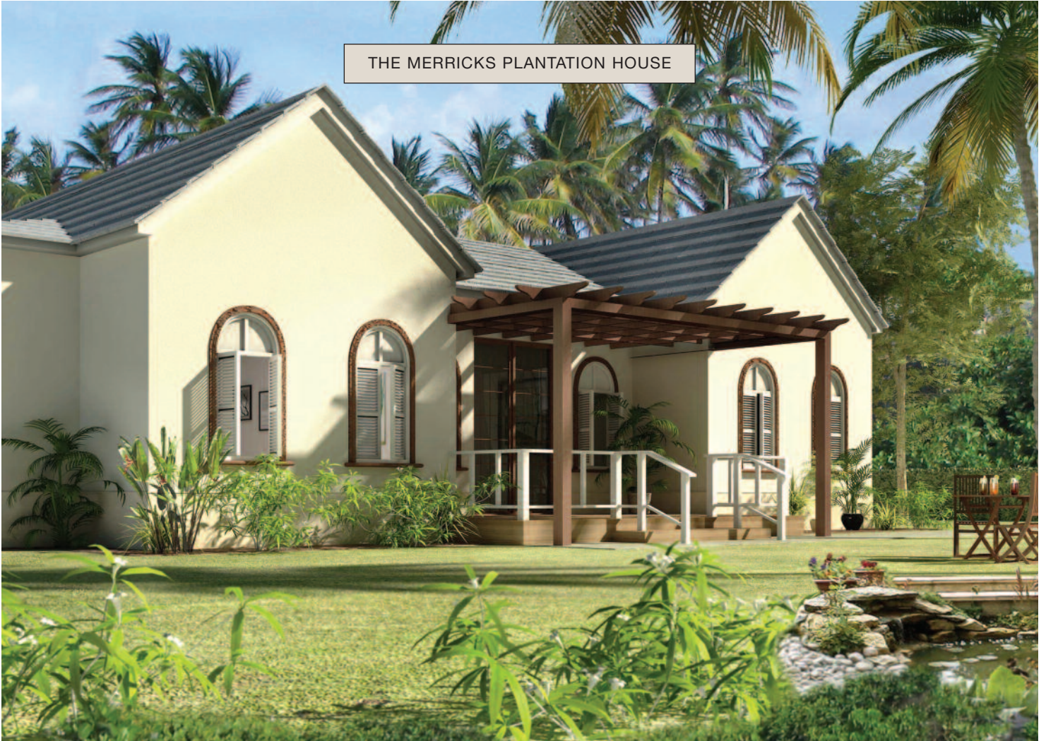
THE MERRICKS PLANTATION HOUSE