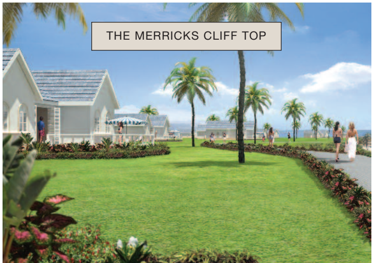
THE MERRICKS CLIFF TOP